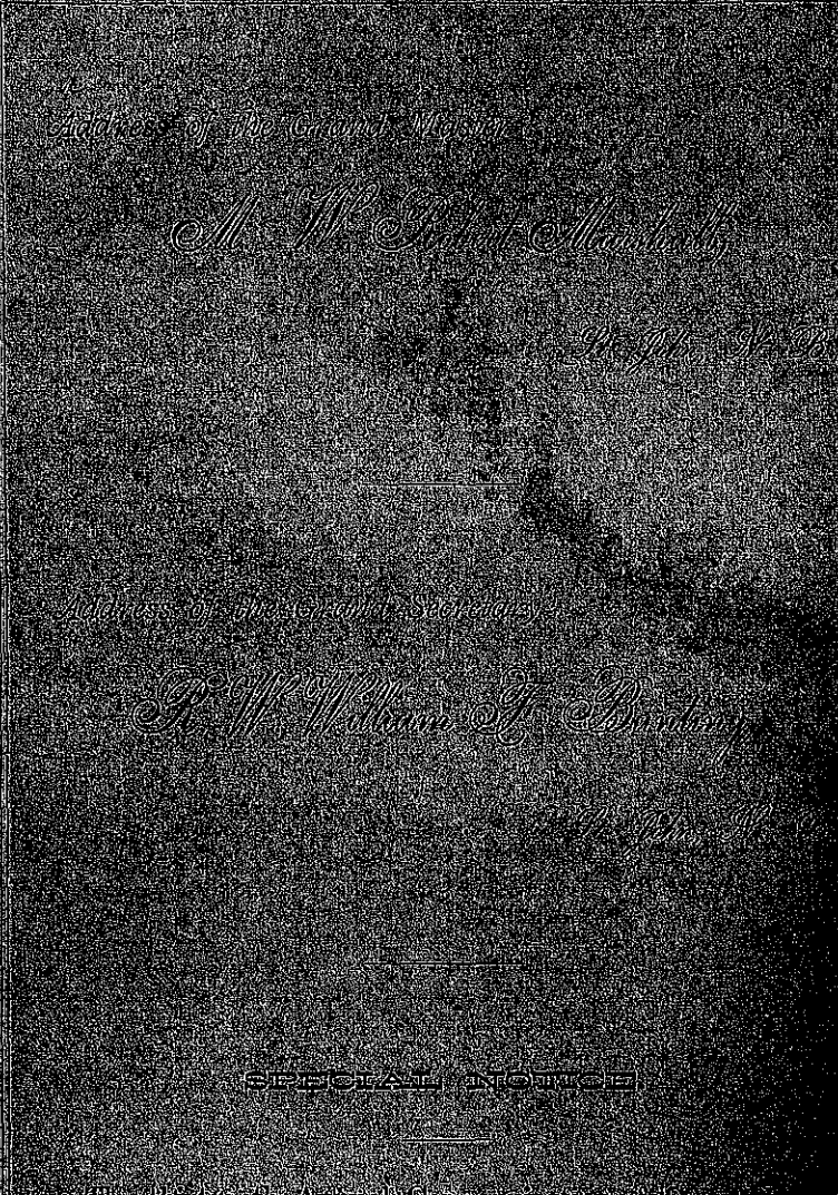
z fiche Blüsteenik Ambunik Connationerinen of Usered Milliansheldein ather Masonic Albunik. City sit SP 1833 Kapadaya blie 27/blis days of Appell ASIV (1830) 18 La die magnooms

reroceed, va Creatual Linds NEW PRINCE D. 1878 AND A. D. 1870